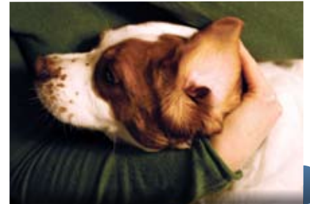
Use one hand to hold the ear flap back so that you can treat the ear with the other.